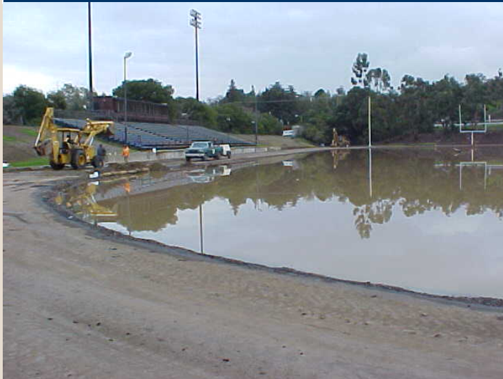
Football Stadium - construction