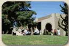
De Anza College